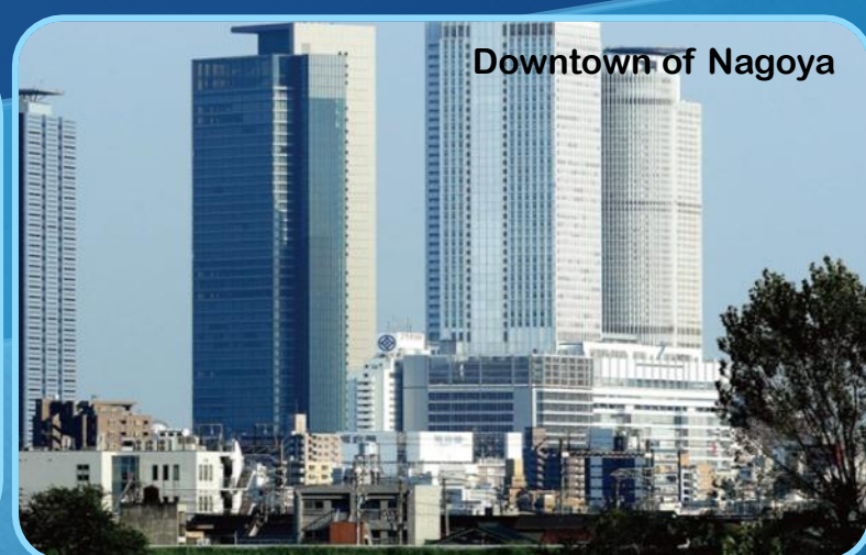
Downtown of Nagoya

The participants conduct independent research as visiting scholars. The primary purpose is to have the students gain research experience, knowledge, and skills at the visiting university, but we also expect them to be driven, flexible, cooperative, and tough in multi-cultural environment. Selected students will stay at Nagoya University for about 10 weeks, as well Nagoya students do in partner universities. Scholarship will be awarded to qualified students.