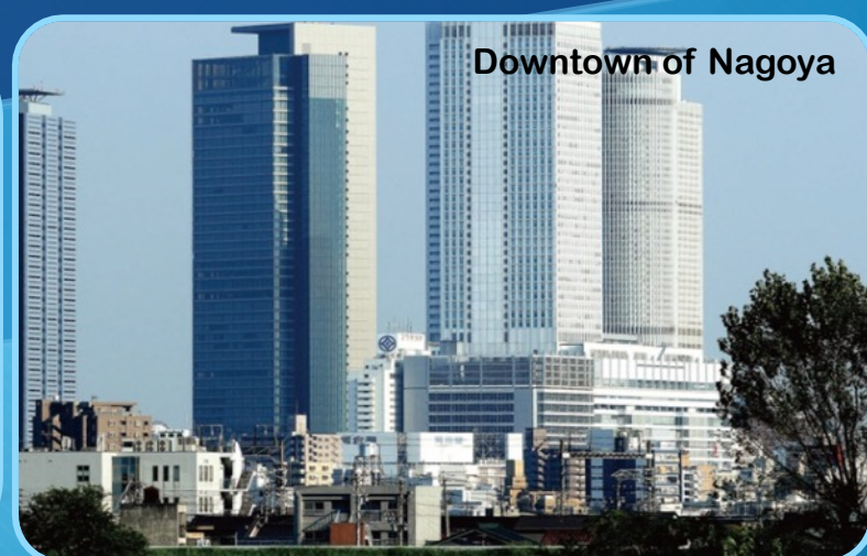
Downtown of Nagoya

The participants conduct independent research as visiting scholars. The primary purpose is to have the students gain research experience, knowledge, and skills at the visiting university, but we also expect them to be driven, flexible, cooperative, and tough in multi-cultural environment. Selected students will stay at Nagoya University for about 10 weeks, as well Nagoya students do in partner universities. Scholarship will be awarded to qualified students.