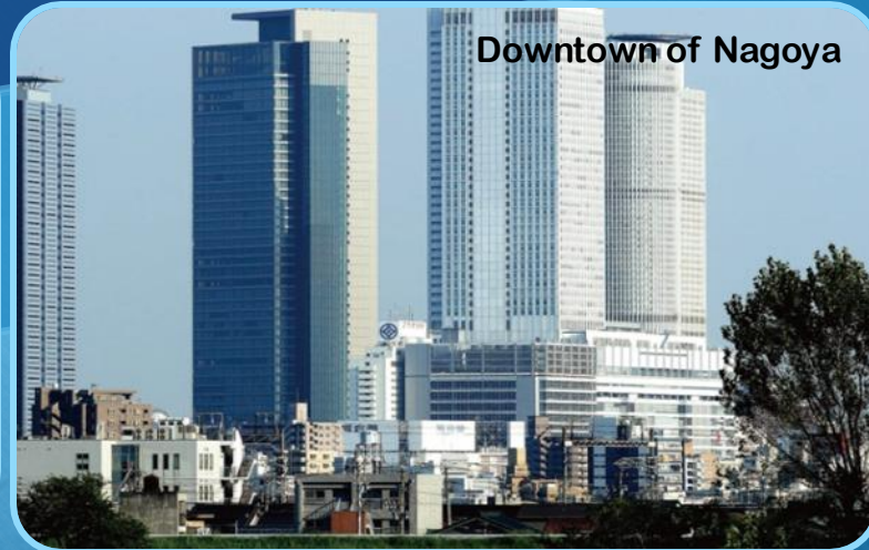
Downtown of Nagoya

The participants conduct independent research as visiting scholars. The primary purpose is to have the students gain research experience, knowledge, and skills at the visiting university, but we also expect them to be driven, flexible, cooperative, and tough in multi-cultural environment. Selected students will stay at Nagoya University for about 10 weeks, as well Nagoya students do in partner universities. Scholarship will be awarded to qualified students.