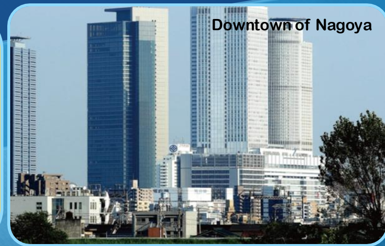
Downtown of Nagoya

The participants conduct independent research as visiting scholars. The primary purpose is to have the students gain research experience, knowledge, and skills at the visiting university, but we also expect them to be driven, flexible, cooperative, and tough in multi-cultural environment. Selected students will stay at Nagoya University for about 10 weeks, as well Nagoya students do in partner universities. Scholarship will be awarded to qualified students.