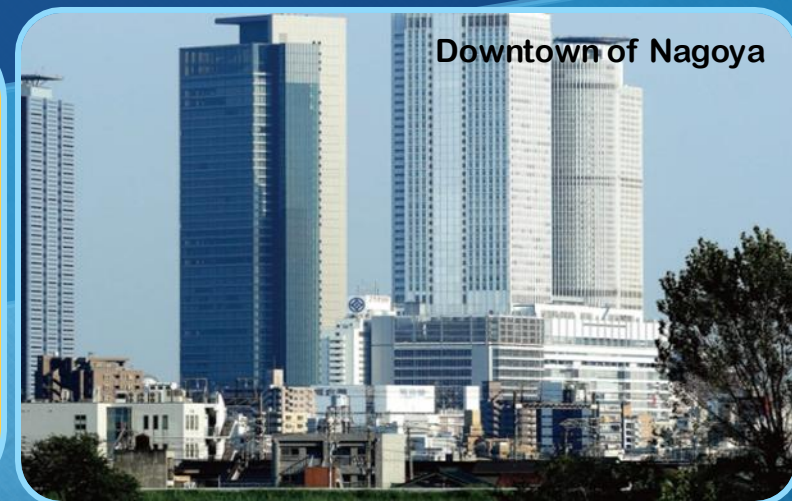
Downtown of Nagoya

The participants conduct independent research as visiting scholars. The primary purpose is to have the students gain research experience, knowledge, and skills at the visiting university, but we also expect them to be driven, flexible, cooperative, and tough in multi-cultural environment. Selected students will stay at Nagoya University for about 10 weeks, as well Nagoya students do in partner universities. Scholarship will be awarded to qualified students.